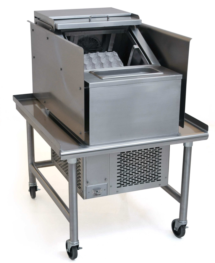
egg station / drop-in unit shown built into griddle stand (not included)

With Eagle's new Refrigerated Egg Station, you will no longer have to scramble around the kitchen. The all-stainless steel construction houses an egg compartment with removable egg basket which holds up to five egg flats—30 eggs per flat, 150 eggs total—and a lift-up door that conveniently stays open. Heat shields on each side allow for use in a cook's line, and are easily removable for cleaning. With features including automatic defrost system, electronic thermostatic control, and foamed-in-place insulation, this unit is exactly what your kitchen needs.