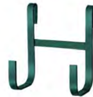
large double snap hook