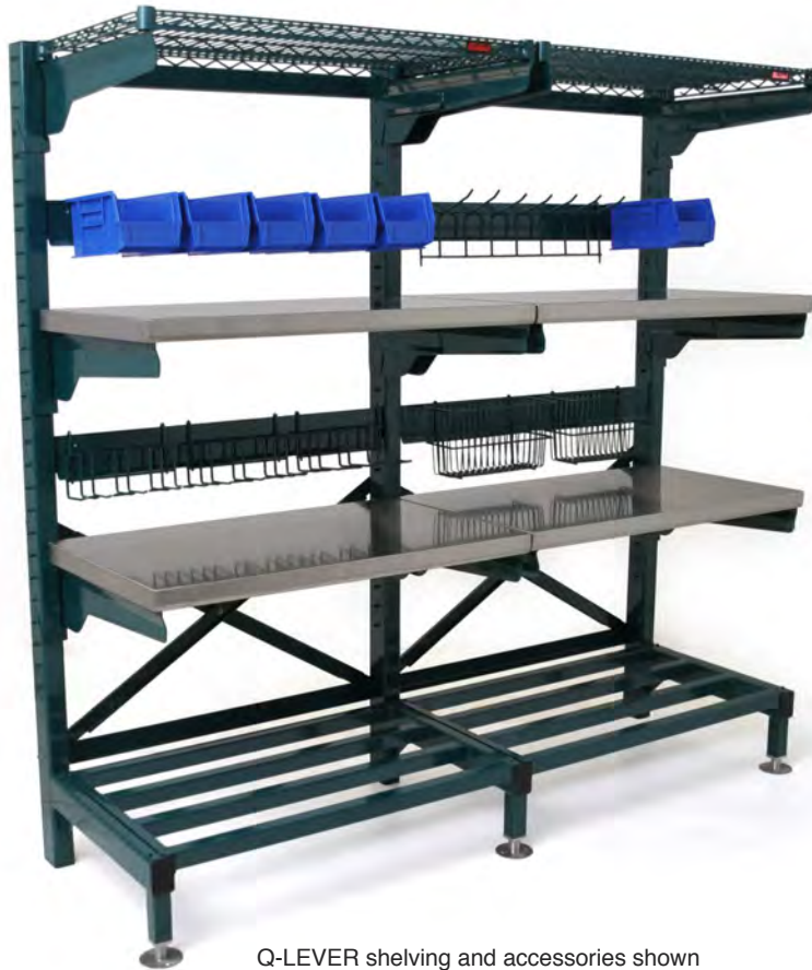
Q-LEVER shelving and accessories shown